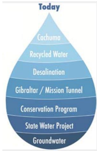
Figure 1 - Current Water Sources

Currently there are seven sources utilized for the various customer requirements of the district. This expansion of the supply base has been necessitated by the increased demand resulting from the increasing permanent population and the growing industry providing entertainment and accommodations for travelers and vacationers. This has worked together with the natural state of the area being semi-arid and prone to regular droughts.