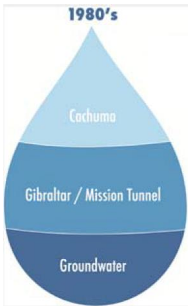
Figure 2 - 1980 Water Sources

This supply scheme is as compared to the situation over thirty years ago when there were only three sources of water. The historical data from the period of drought running from 1986 to 1993 showed the level of Lake Cachuma, the main source of water supply, going from near maximum capacity (193,305 ac-ft) to about 18% of that by 1991. At the rate of use, if the drought had not been stemmed by a return of average weather and therefore rainfall, the lake would have had only enough for just about a year of supply. This assumes that every last drop could have been used which is not the case (Taylor March 15, 2017, slide 28).